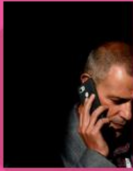
AutoGreg LLC Florida Used Car Dealer