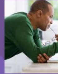
Victory Used Car Dealership LLC Georgia Used Car Dealer