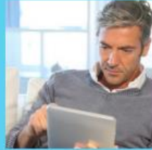
Privilege Import Auto Minnesota Used Car Dealer